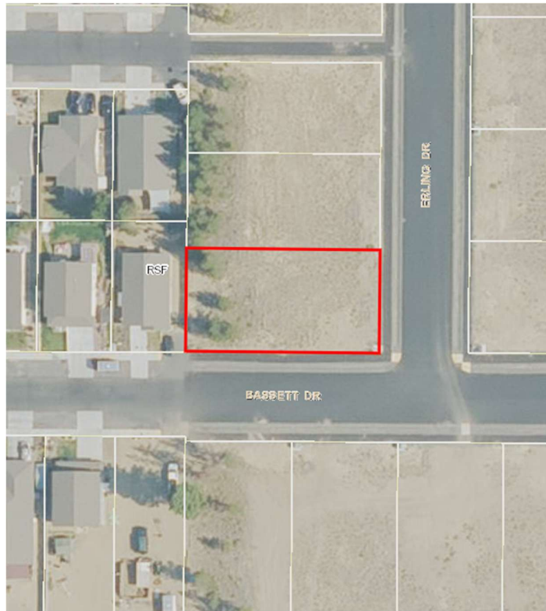
Figure 1 Location Map via Deschutes County GIS