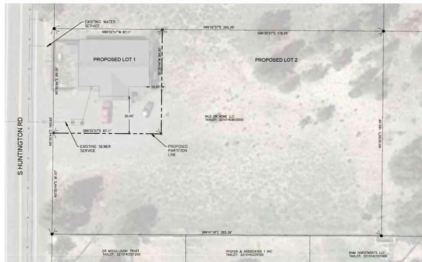
Figure 1: Proposed Partition

PROPOSAL: The applicant proposes to partition the subject property into two new parcels (Figure 1). Parcel 1 will be approximately 7,347 square feet and Parcel 2 will be approximately 36, 598 square feet.