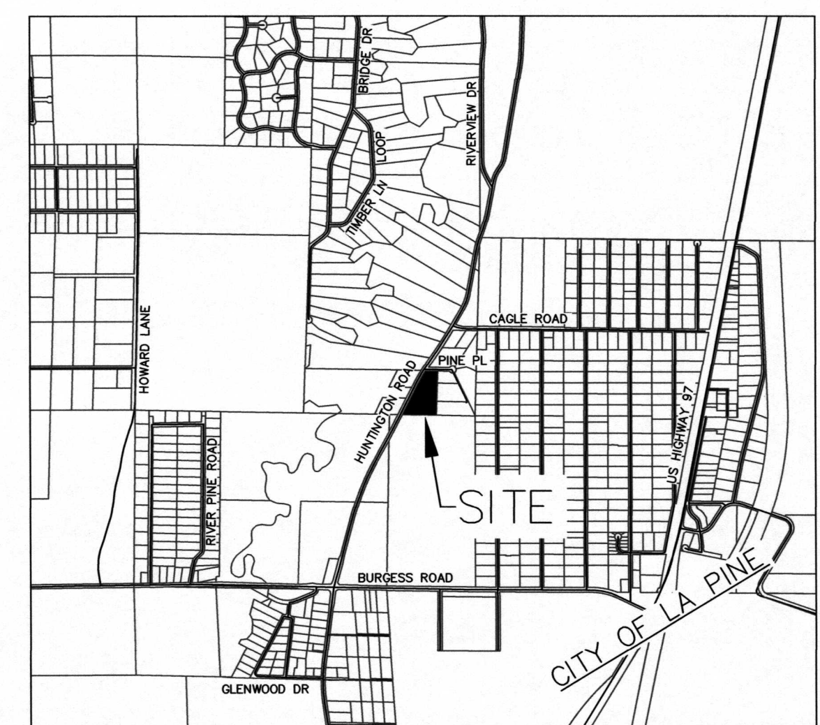
VICINITY MAP SCALE: 1" = 2000'

SITE ADDRESS: 52640 HUNTINGTON ROAD TAX MAP & LOT: 211035A000900 ZONE: RSF - RESIDENTIAL SINGLE FAMILY TOTAL AREA: 5.30 ACRES PRESENT USE: SINGLE FAMILY DWELLING PROPOSED USE: 2 PARCEL PARTITION PARCEL 1: 1.20 ACRES PARCEL 2: 4.10 ACRES WATER: INDIVIDUAL WELL, FUTURE CITY OF LAPINE WATER SEWER: EX. SEPTIC SYSTEM, FUTURE CITY OF LAPINE SEWER AND WATER POWER: MIDSTATE PHONE: CENTURYLINK IRRIGATION DIST: NONE