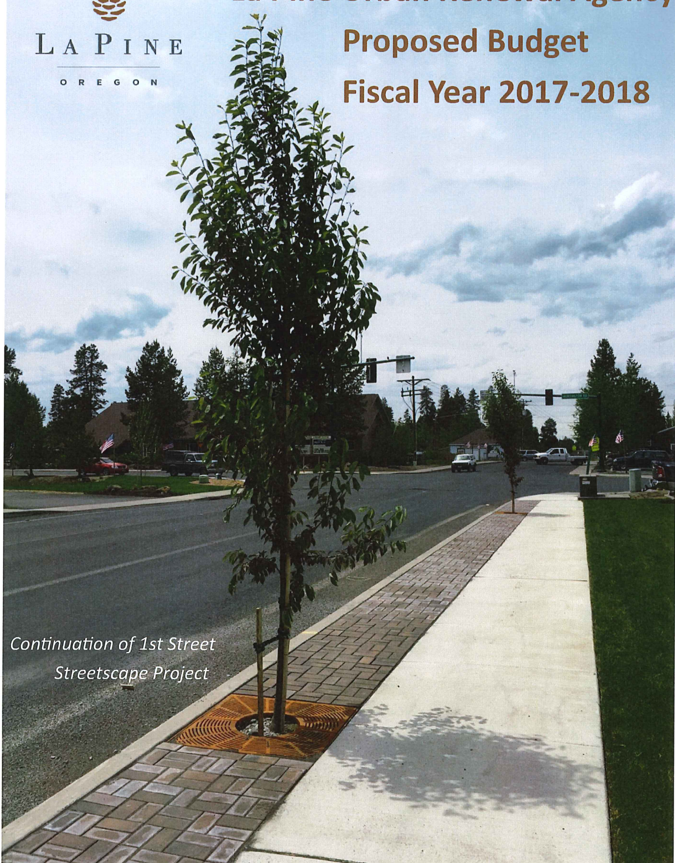
Continuation of 1st Street Streetscape Project